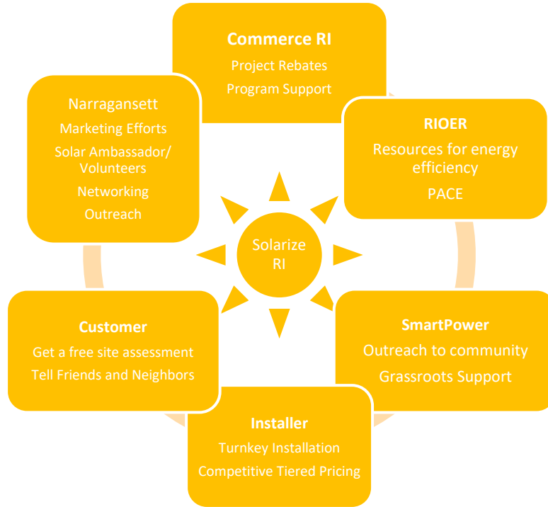
Figure 1. Anticipated roles of the different parties in Solarize Rhode Island. 6

Chart 1 below outlines the roles of different parties participating in Solarize Rhode Island.